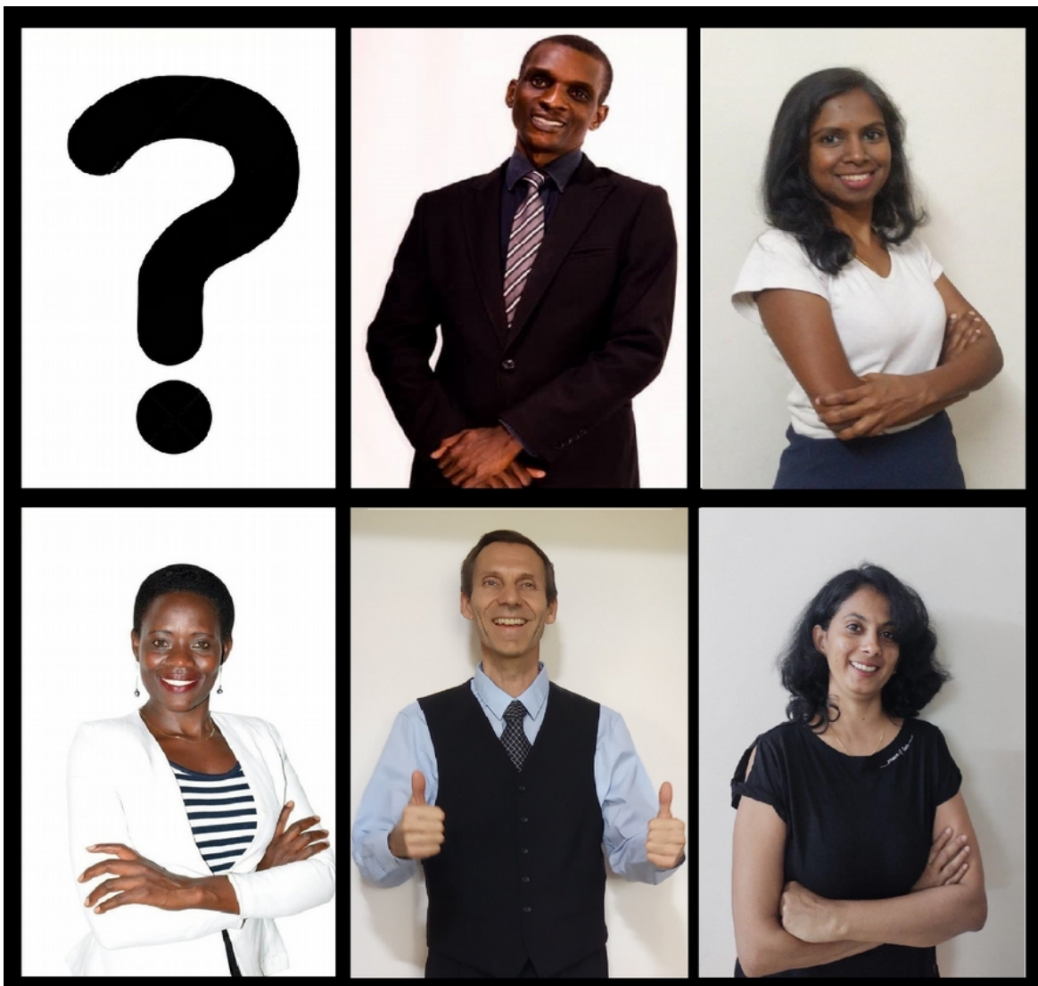
Illustration: Five of the Core Team Members in 2023