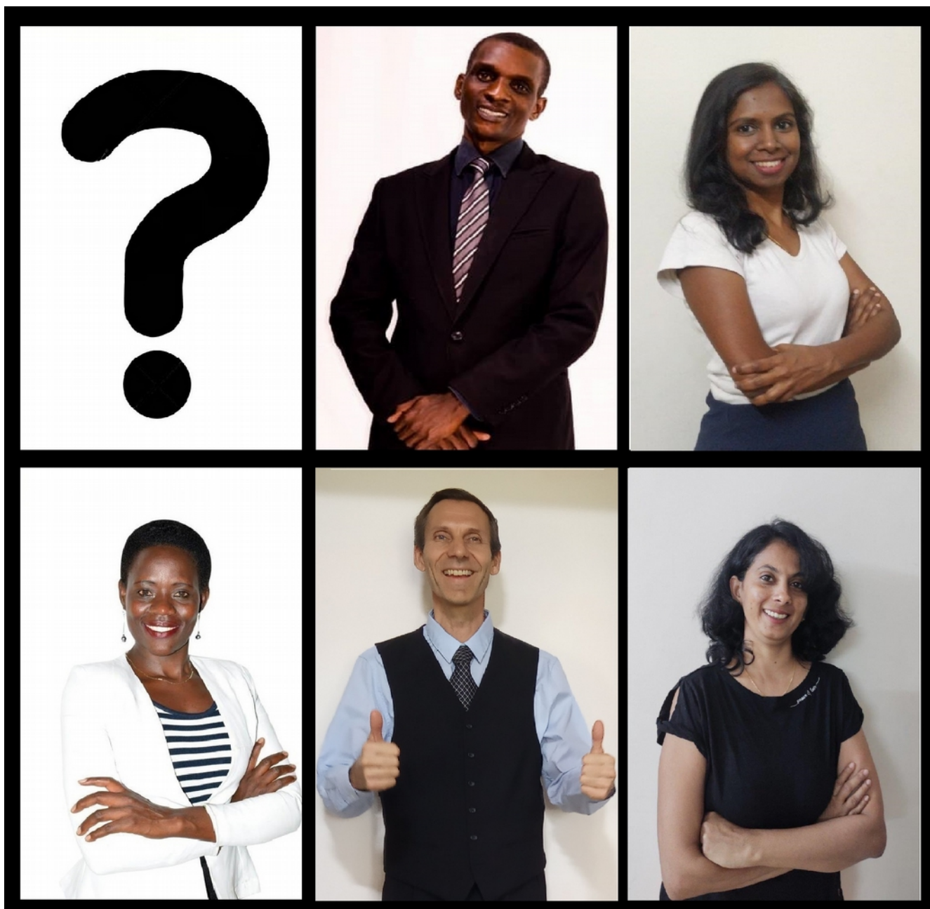
Photo – the 5 Core Team Members per October 2021