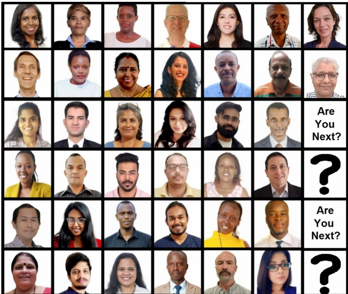
Illustration 1: Some of our leaders and members in 2023

Then watch the second video Short Life Story and Vision Founder of the Sustainable World Project. Make a new comment on our Facebook post and share one thing you found valuable while watching this video. You can write: "What I found valuable in this video . . . " Here is the link - https://www.facebook.com/groups/725583880829287/permalink/3226257010761949